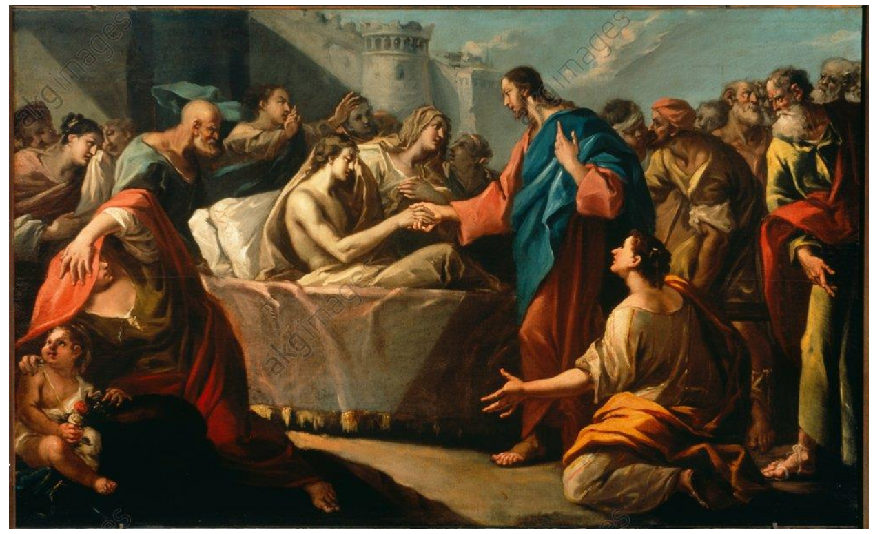
Antonio Pellegrini The Raising of the Young Man from Nain from the Dead Venice, S.Maria del Giglio