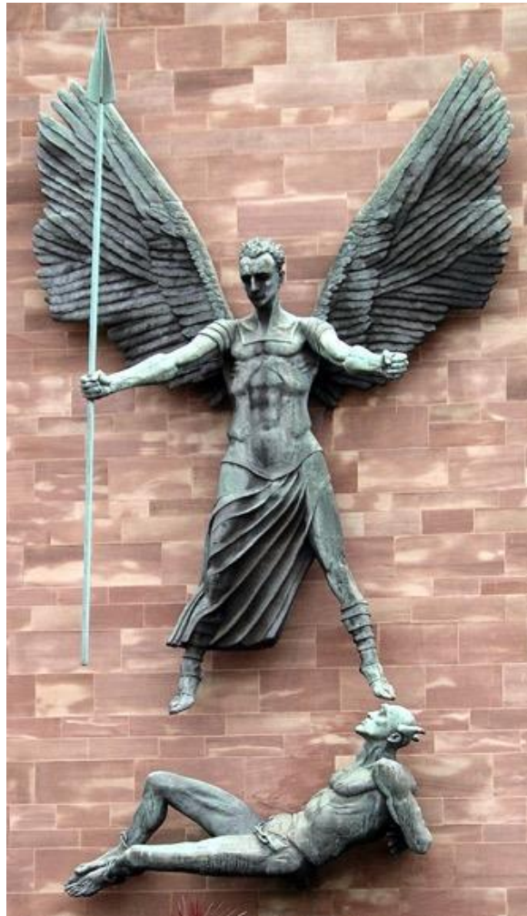
Sir Jacob Epstein St Michael's victory over the Devil Bronze sculpture, 1958, Coventry Cathedral