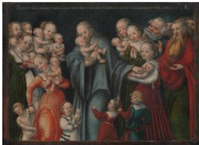
Lucas Cranach the Younger and Workshop Christ Blessing the Children