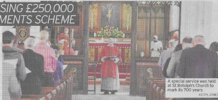
A special service was held at St Botolph's Church to mark its 700 years

The church hopes to raise around £250,000 in total for all the redevelopment needed, but it would take it in stages and improve facilities on an individual basis.