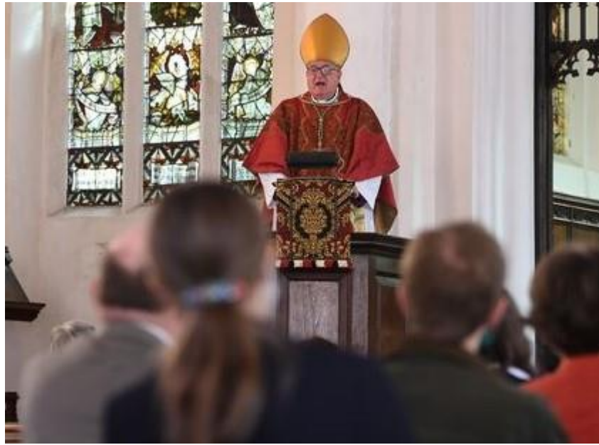
Figure 3 The Bishop preaches the sermon

Thanks to Tamara Sword, the Cambridge News sent a photographer to capture images from the service and I gave an interview separately to a reporter, all of which resulted in a feature article on 28 th June, as follows: