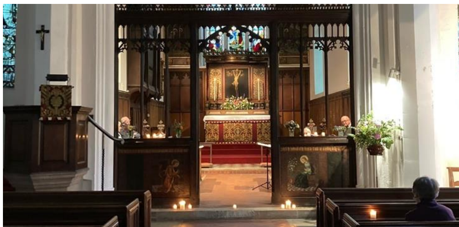
Figure 9 Compline with candlelight on 30th June 2021