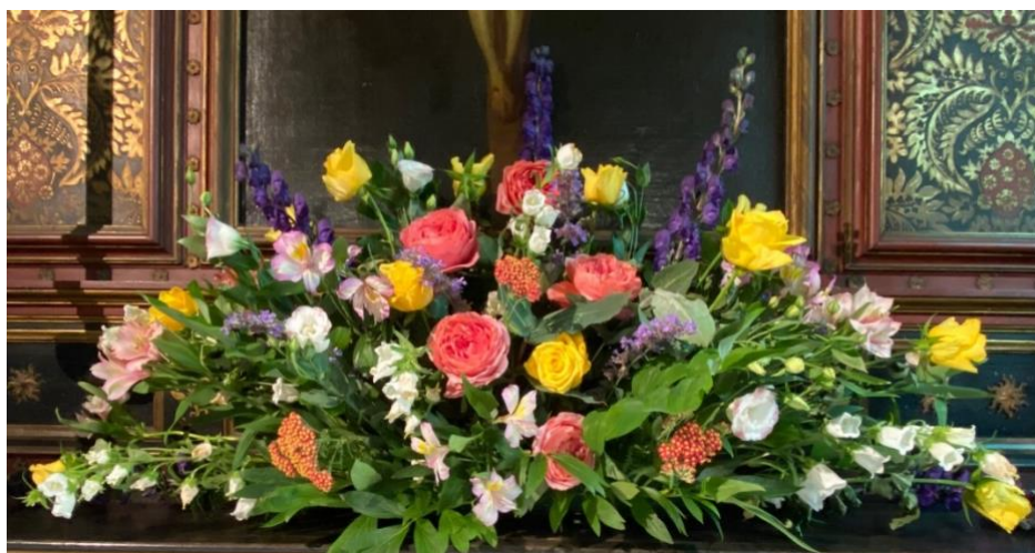
Figure 7 The flower display on the Reredos