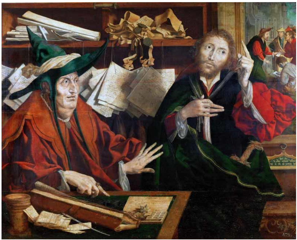
Marinus van Reymerswaele The Parable of the Unfaithful Steward 1540 Kunsthistorisches Museum, Vienna,