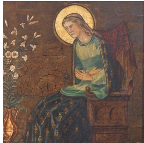
Godfrey Gray The Annunciation ; paintings on the Rood Screen, St Botolph's Church