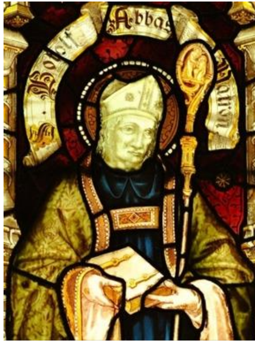
Stained Glass, St Botolph's Church

The congregation is cordially invited to make their way into the garden for light refreshments