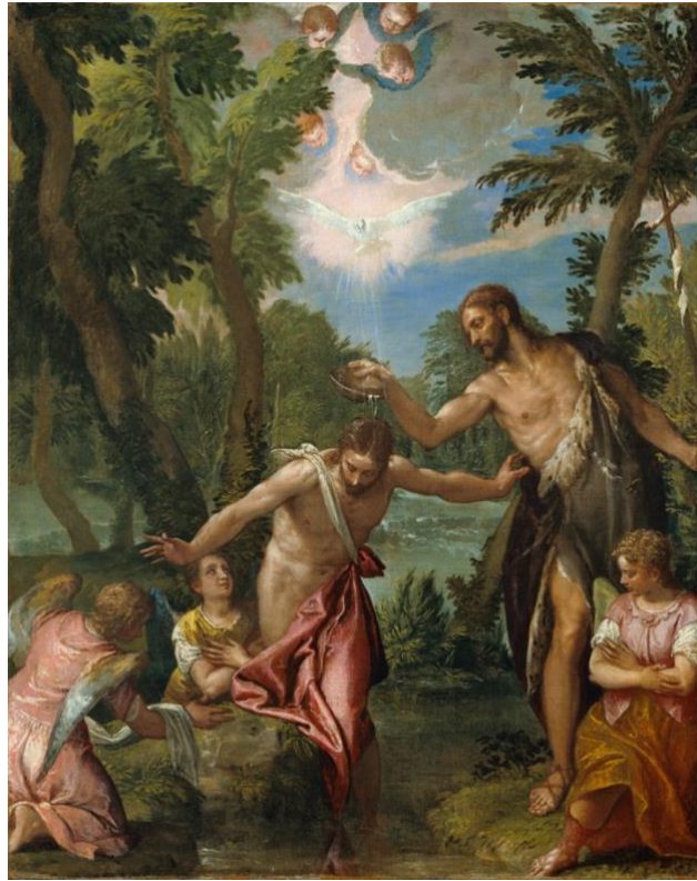
Paolo Veronese and workshop The Baptism of Christ 1580–88 Oil on canvas, Getty Museum, USA