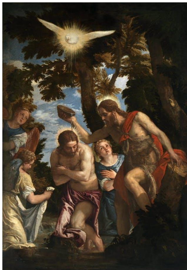
Veronese The Baptism of Christ (c1580) Oil on canvas, Pitti Palace, Florence

The iconography is similar to the paintings except Christ is depicted as a young boy.