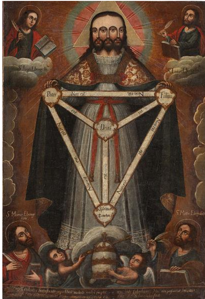
Anonymous Cusco School Trifacial Trinity (1750–70); Lima Art Museum