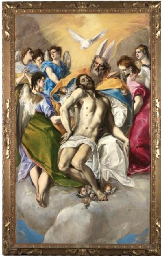
El Greco The Holy Trinity ; The Prado Museum, Madrid

https://www.youtube.com/watch?v=U3AVRIVhP_0