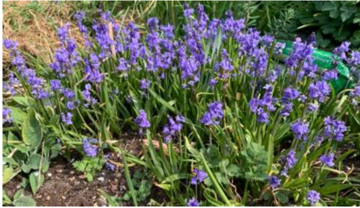
Bluebells in Barton