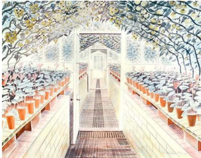
Eric Ravilious The Greenhouse: Cyclamen and Tomatoes (1935); watercolour, Tate Modern

Eric William Ravilious (1903–42) was a British painter, designer, book illustrator and wood-engraver. He grew up in East Sussex and is particularly known for his watercolours of the South Downs and other English landscapes, which examine English landscape and vernacular art with an off-kilter, modernist sensibility and clarity. He served as a war artist, and died when the aircraft he was in was lost off °Iceland.