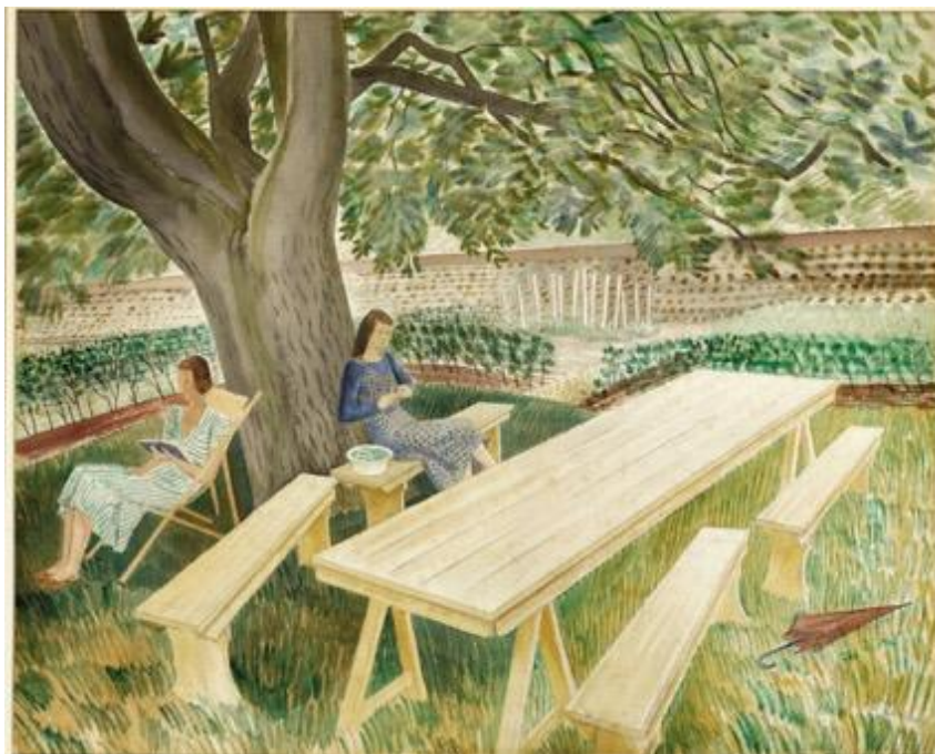
Eric Ravilious (1933). Two Women in a Garden ; watercolour and pencil on paper, The Fry Art Gallery, Saffron Walden.

Art controls Time and can freeze the moment as was the case with Ravilious, renowned for his watercolours of English landscapes. He captured the wonder of nature, its rebirth, its goodness and beauty. His power came from his restraint; the deeper meanings lay beneath the surface. Wordsworth wrote ‘... the human mind is capable of being excited without the application of gross and violent stimulants; and he must have a very faint perception of its beauty and dignity who does not know this.’ 1 Ravilious’ subjects and compositions captured this sentiment.