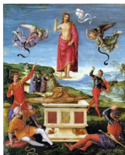
Raphael (1499-1502) The Resurrection of Christ . Oil on wood. São Paulo Museum of Art, Brazil.

https://www.youtube.com/watch?v=62fawgUUpg8