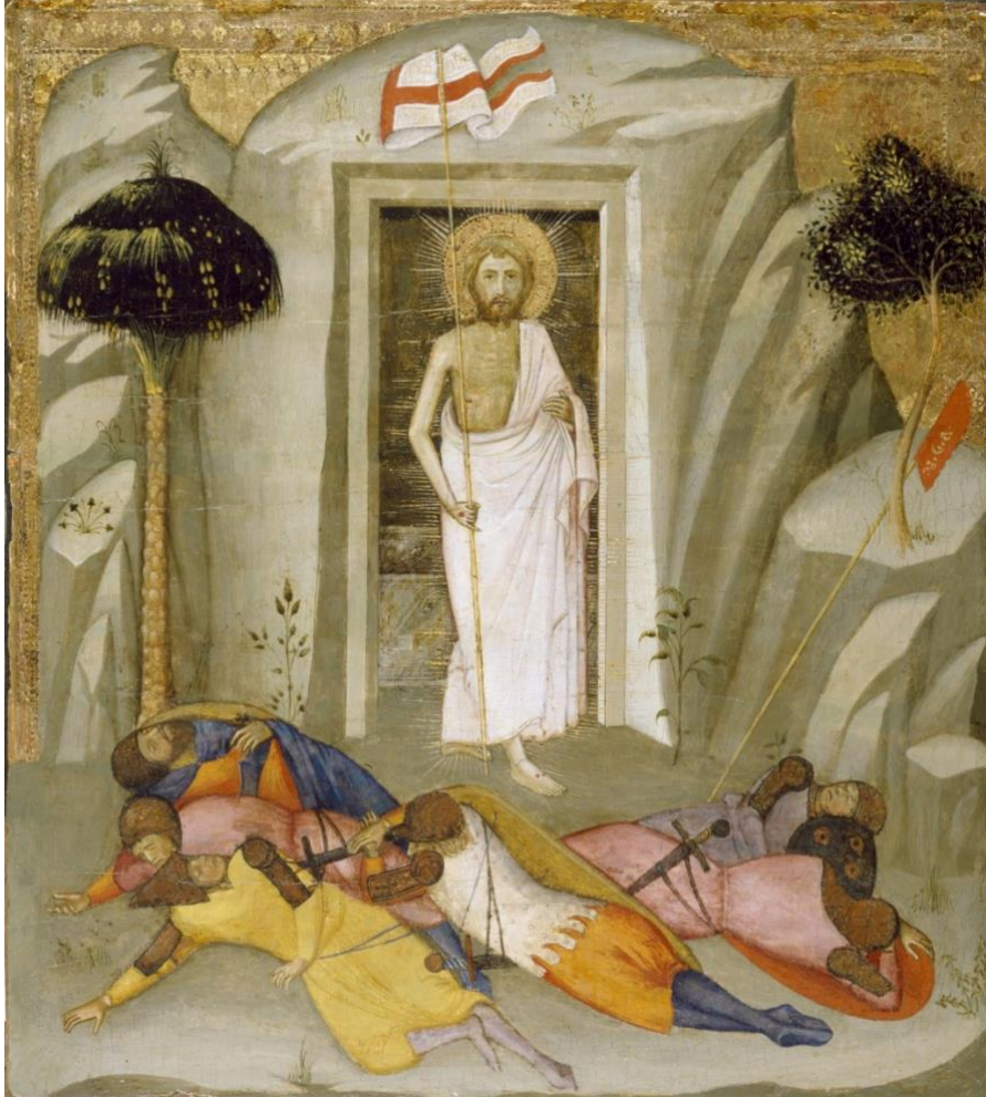
The Resurrection: Andrea di Bartolo (c.1360–1428) Walters Art Museum