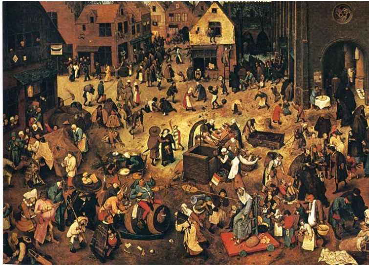
Pieter Bruegel the Elder The Fight between Carnival and Lent