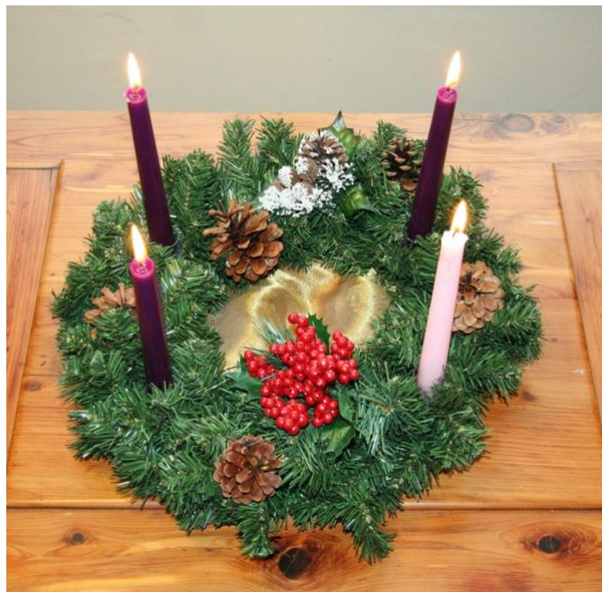
An Advent wreath with the customary single rose-coloured candle for Gaudete Sunday