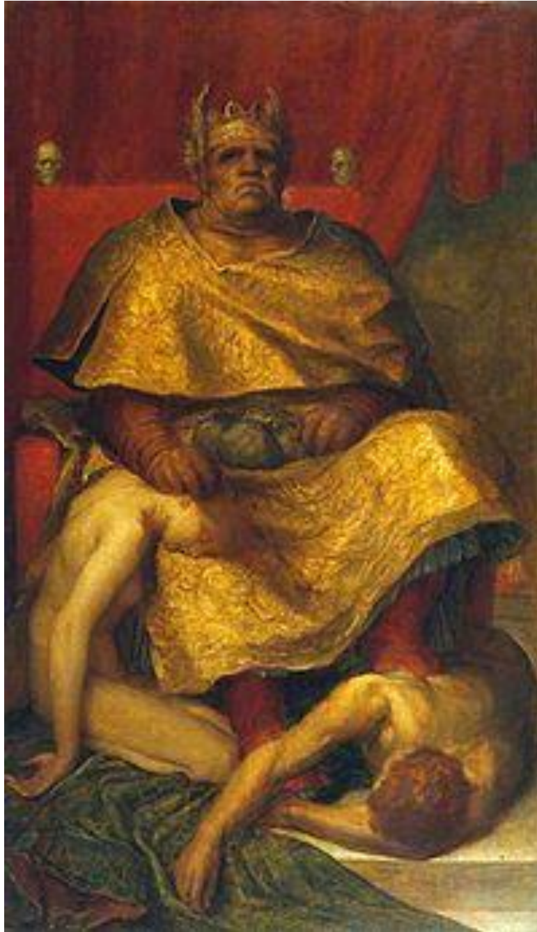
George Frederic Watts Mammon (1884-5)