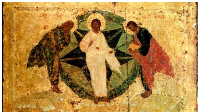
Transfiguration of Jesus (1405) by Andrei Rublev

Lift up your heads, O ye gates; and be ye lift up, ye everlasting doors: and the King of glory shall come in.