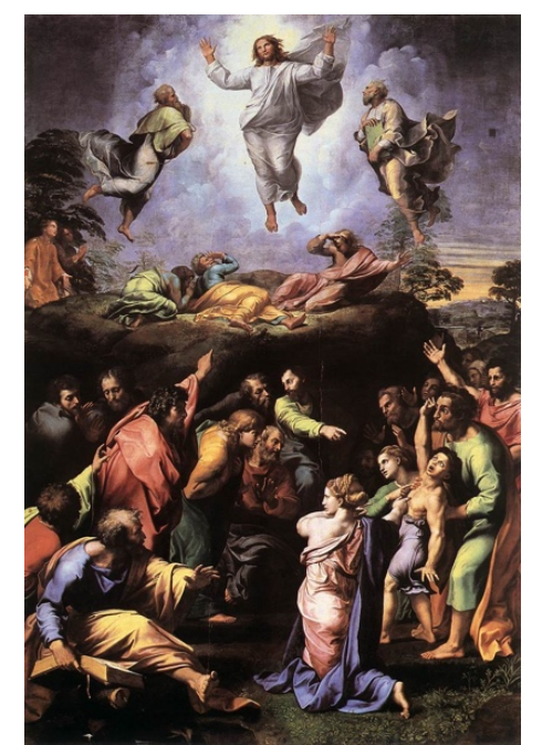
Raphael The Transfiguration 1518-20. Oil on wood. Pinacoteca Apostolica, Vatican.

Raphael's altarpiece illustrates two episodes narrated in the gospels of Matthew, Mark and Luke: the Transfiguration above, with Christ in glory between the prophets Moses and Elijah, and below, in the foreground, the meeting of the disciples with the demoniac youth who will be miraculously cured by Christ on his return from Mount Tabor. This lower scene, taking place simultaneously, is not part of the Transfiguration itself and precedes the successful healing of the boy by Christ later.<sup>1</sup>