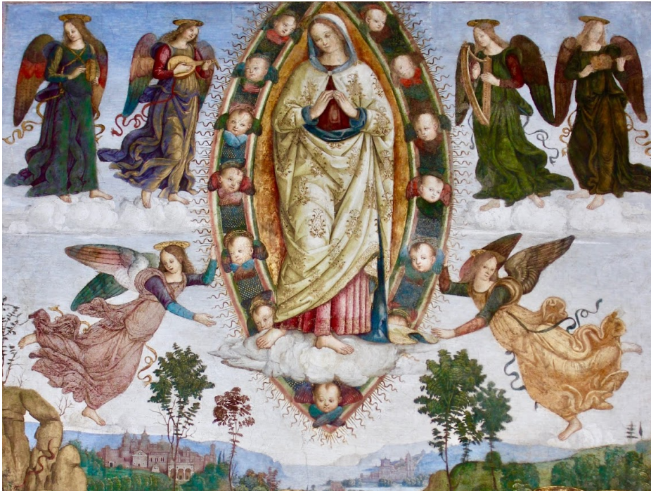
Pintoricchio Assumption of the Virgin Mary (c.1490) Fresco - Basso della Rovere Chapel, Santa Maria del Popolo, Rome